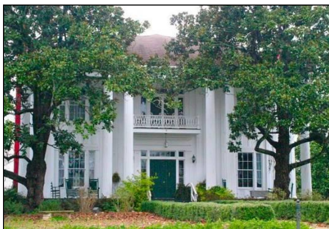
Antebellum Mansion in Aberdeen, Mississippi, Where I Worked for Conoco Chemicals. This is "Holiday Haven," Built in 1850 and Still a Family Residence

I have four sisters living in various States. The Lord used my dad early in my life to give me a deep appreciation for engineering and science generally. My mother gave me a deep love of music which I enjoy for relaxation.