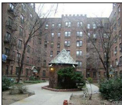
Where We Lived in New York City. It Was Built in 1922; Now Small Condos There Are Going for Half a Million

I have four sisters living in various States. The Lord used my dad early in my life to give me a deep appreciation for engineering and science generally. My mother gave me a deep love of music which I enjoy for relaxation.