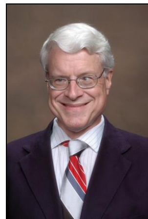
Me as Professor of Natural Science at CCC Since 1995