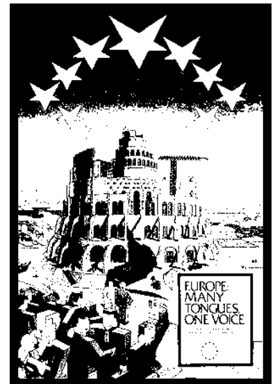
Reconstructing a One-World State: European Union Poster